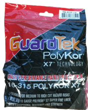
Vendor 1 Fold