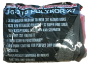
Vendor 2 Fold