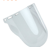
CHINGUARD CLEAR VISOR