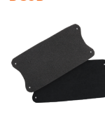
BROWGUARD SWEAT BAND