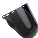
CHINGUARD SMOKE VISOR