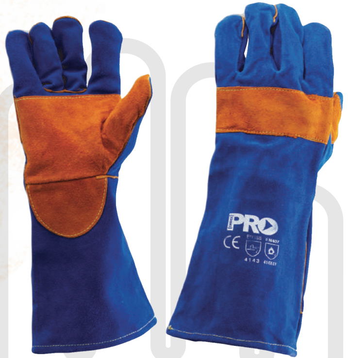
PRODUCT CODE: KBW16E